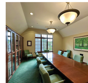
Painting in Wade Seminar Room.

Lewis, of course, walked with others beforehand, preparing him for his final conversion to Christianity.