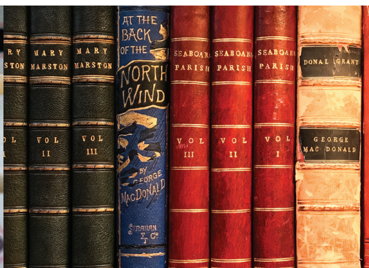
Several MacDonald books, including Donal Grant

This handwritten manuscript, passed down through the MacDonald family, contains autobiographical glimpses into George’s childhood in the Scottish town of Huntly.