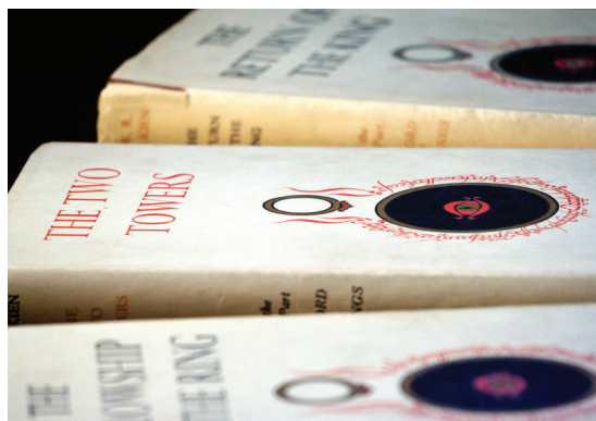
Set of LOTR first editions autographed by Tolkien