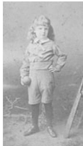
A young G.K. Chesterton.

Today all too few, I fear, are able to enter into and share in the experience Chesterton's words seek to convey. This is due, in part, to the kind of world in which we live, or more particularly to the culture we contend with each day. It is a driven world, at times insanely so. It is a world of people—people like us—caught up in a desperate attempt to make something of ourselves. In this world,