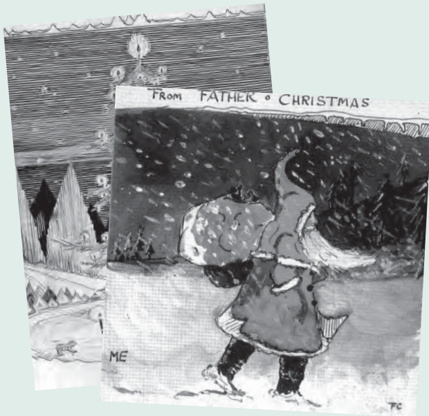
J.R.R. Tolkien drew this picture of Father Christmas for his children. The Bodleian Library in Oxford has turned several of the drawings from Tolkien's "Father Christmas Letters" into Christmas greeting cards, which are available at the Wade Center gift store.

The Marion E. Wade Center Wheaton College Wheaton, Illinois 60187